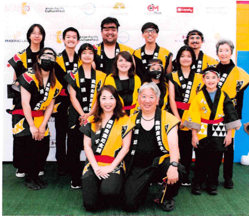
Asian Pacific CultureFest

The event served to celebrate and uplift the diversity of Asian American and Pacific Islander arts, culture, heritage and contributions throughout the Sacramento region. It also kicked off the national observances of May as Asian American and Native Hawaiian/Pacific Islander Heritage month.