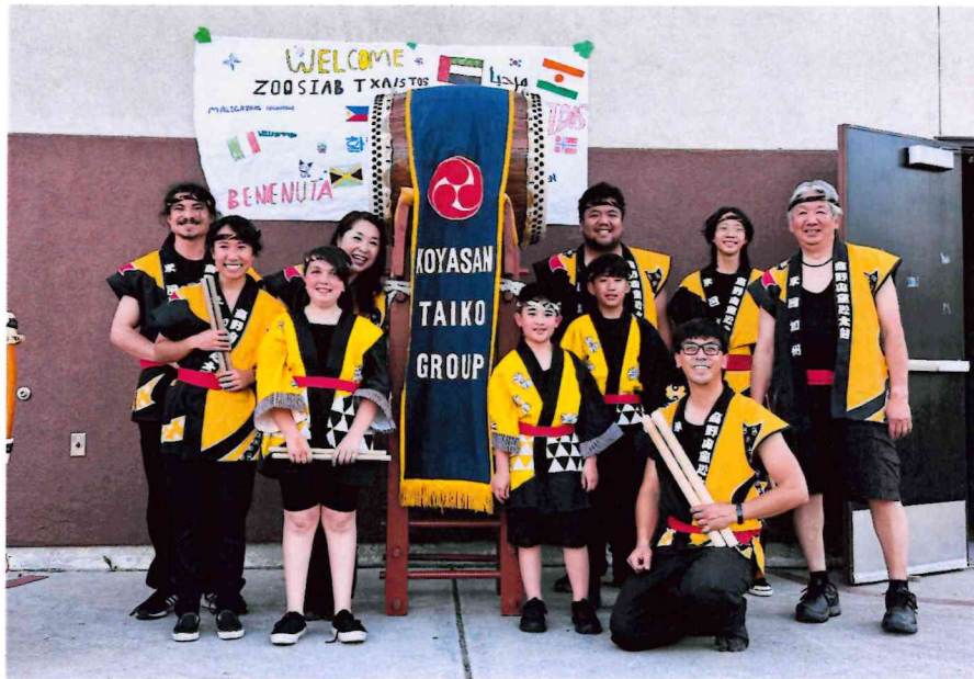
David Reese Elementary

The Koyasan Taiko Group has been very busy performing at several events these past few months. They performed at Japan Day at Sacramento State University; Asian Pacific CultureFest in Elk Grove; Parkway Half Marathon; and at David Reese Elementary. Here are a few photos taken from some of the events.