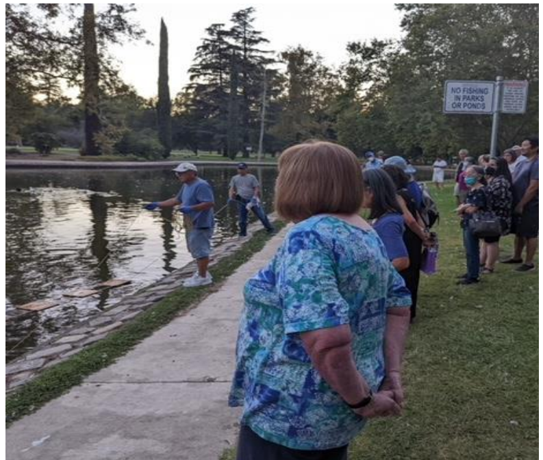
Temple members and their family and friends watching the floating of the lanterns.