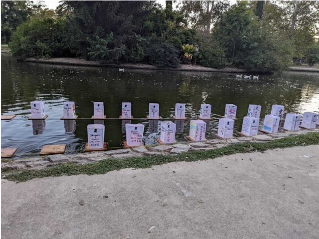
A view of the lanterns floating on the Mayor Anne Rudin Peace Pond.